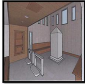
Architectural rendering of interior of chapel

reservation of the Eucharist. This will be a place in which we honor the real presence of the Risen Christ in the reserved Eucharist. It will be a place of beauty and mystery, reflecting our deep Catholic faith in Christ among us; a place to pray for the sick and the dying, and a place to sit and reflect in wonder at the mystery of Christ really present.