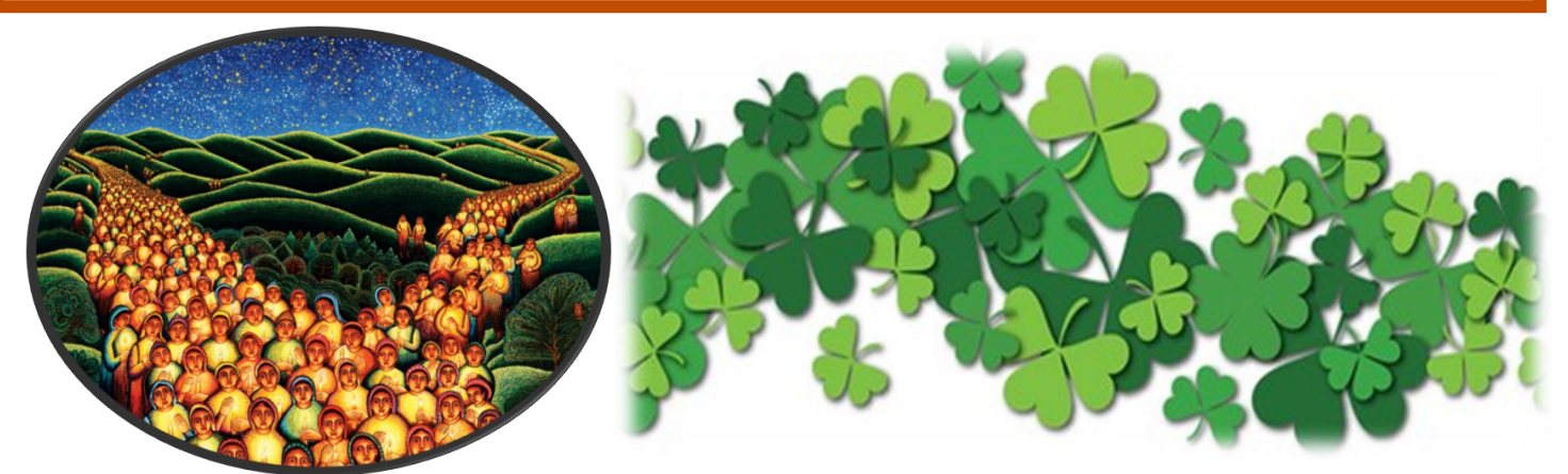
© John August Swanson Festival of Lights. Used with permission