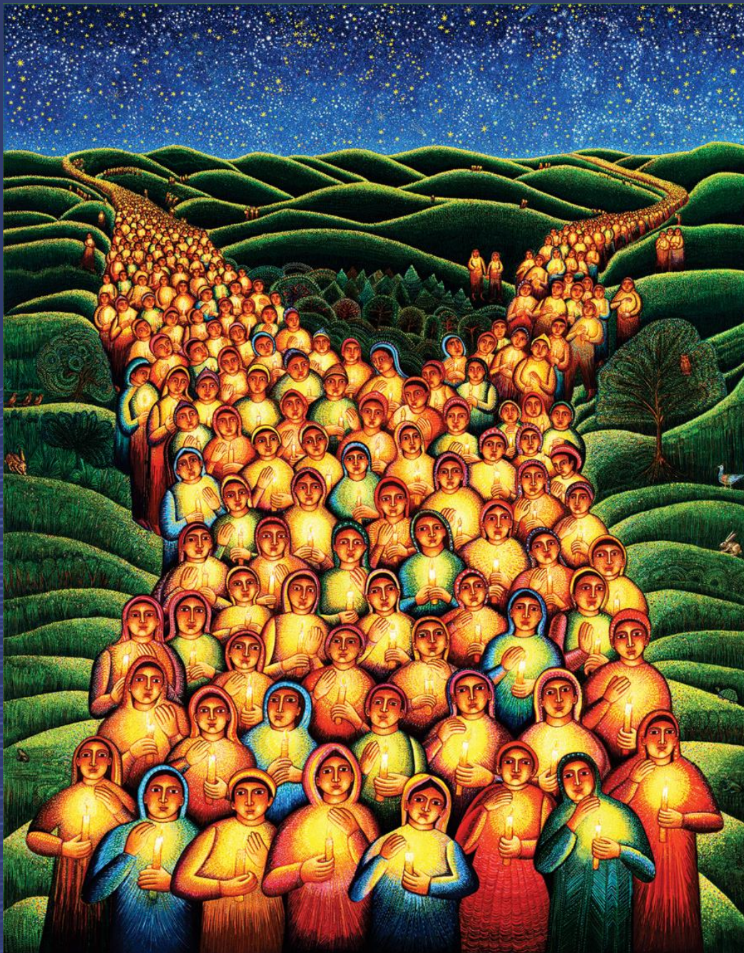
Festival of Lights © John August Swanson. ALL RIGHTS RESERVED. Used with permission